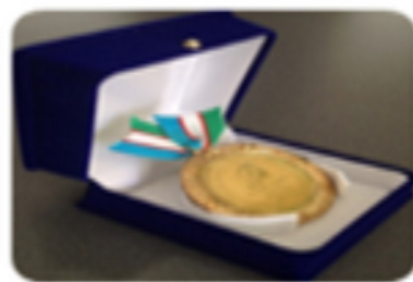
«QOVUN DARAXTI» The recognition of the product.