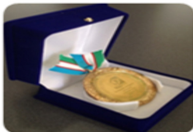
HTI GROUP-The best packaging