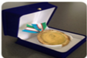
UMAROV- The best product"

On November 30,2017 at the official opening ceremony of the Exhibition the following companies were awarded with "gold" medals.